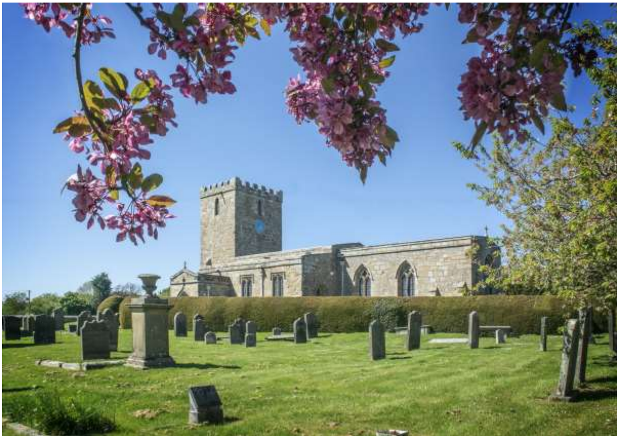
St Mary Magdalene, Whalton