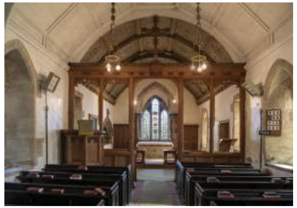
St John's, Meldon