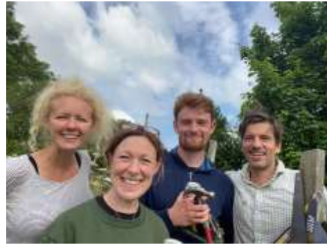
The Roost Team