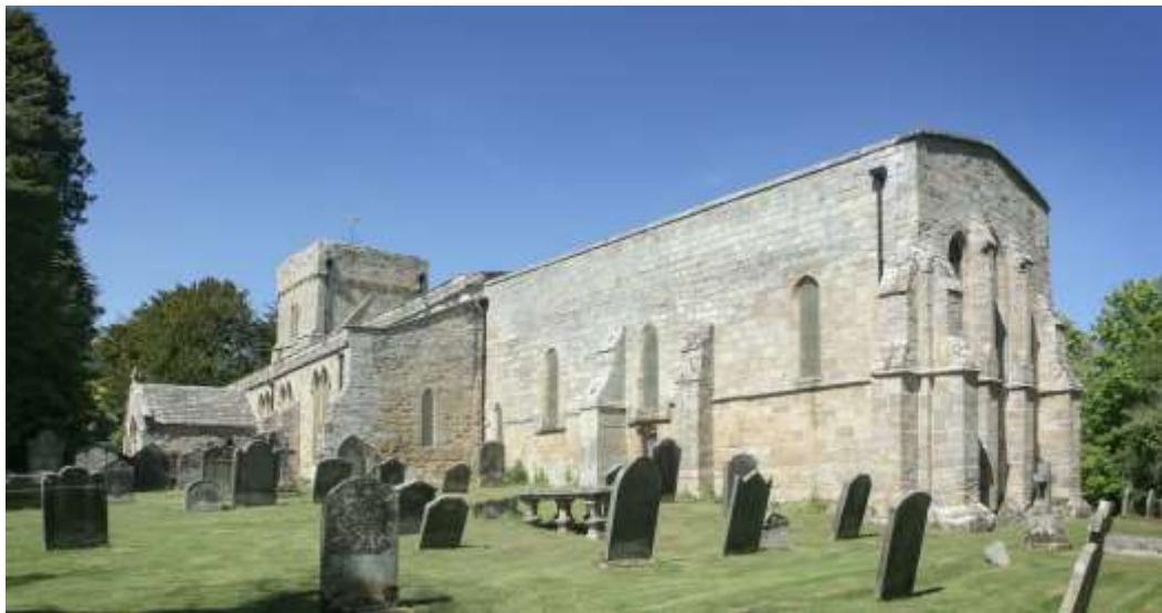
St Andrew's, Hartburn