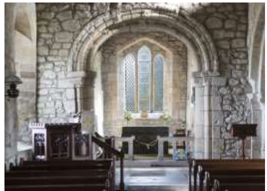
St Andrew's, Bolam